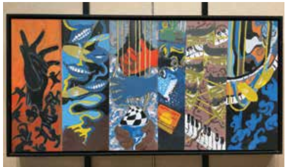
"Quiet Pride" Tayron Lopez '16 (Taiitan)