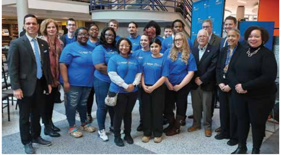
Students and SUNY officials joined College leaders in highlighting the benefits and expansion of Advancing Success in Associate Pathways (ASAP). See more on page 11.

SUNY Schenectady Office of Marketing and Public Relations 78 Washington Avenue, Schenectady, NY 12305 P: 518-381-1323 | pr@sunysccc.edu