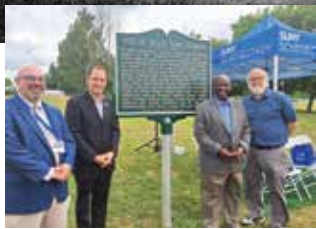
Top: Island Park Stadium, now part of campus